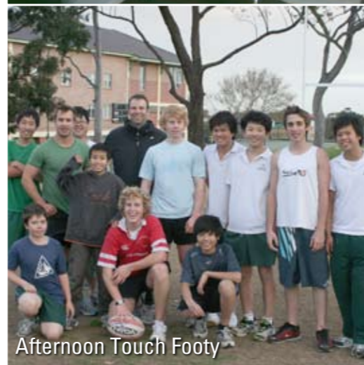
Afternoon Touch Footy