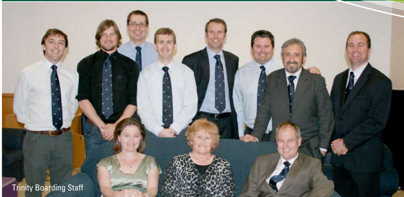
Trinity Boarding Staff