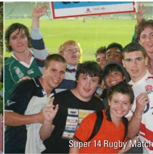
Super 14 Rugby Match