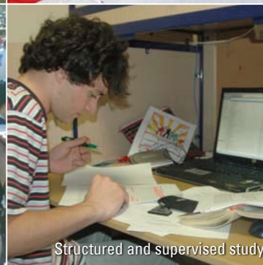
Structured and supervised study