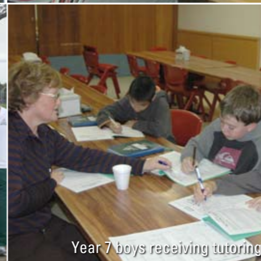
Year 7 boys receiving tutoring